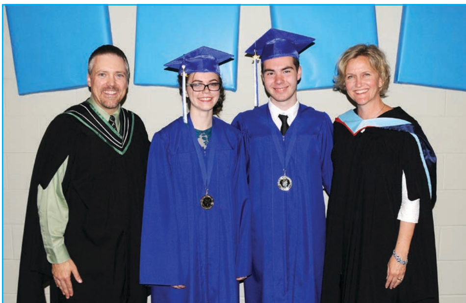
2017 Great Lakes graduation –