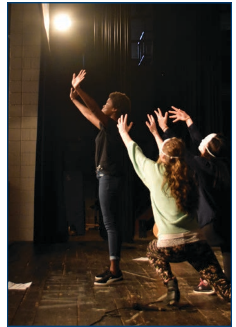
The small girls’ a cappella group sings and performs a dramatic interpretation of their original song “Warrior.”

The Chorus performed songs that they have been working on all year including an original song written by students that also featured a dramatic element. The original song, “Warrior,” was sung as the backdrop to a skit in which a person depicts someone who is looking to God in the midst of facing her personal “Goliaths.” The students wrote this song as a declaration that God will overcome the “Goliaths”